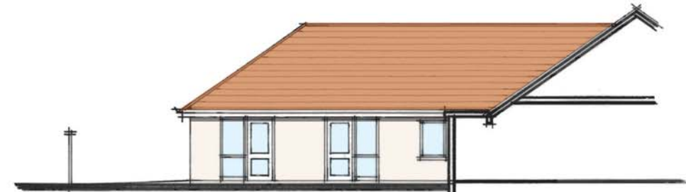
SOUTH WEST COURTYARD ELEVATION