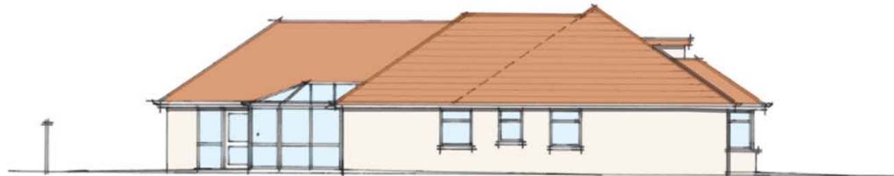
SOUTH WEST (SIDE) ELEVATION