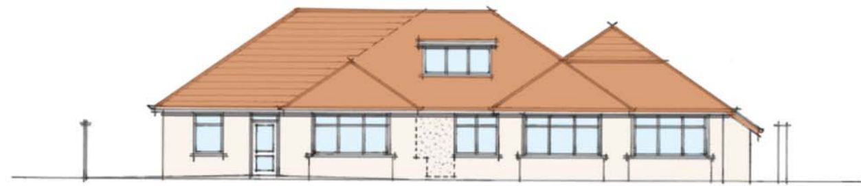
SOUTH EAST (FRONT) ELEVATION