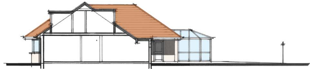
NORTH EAST COURTYARD ELEVATION