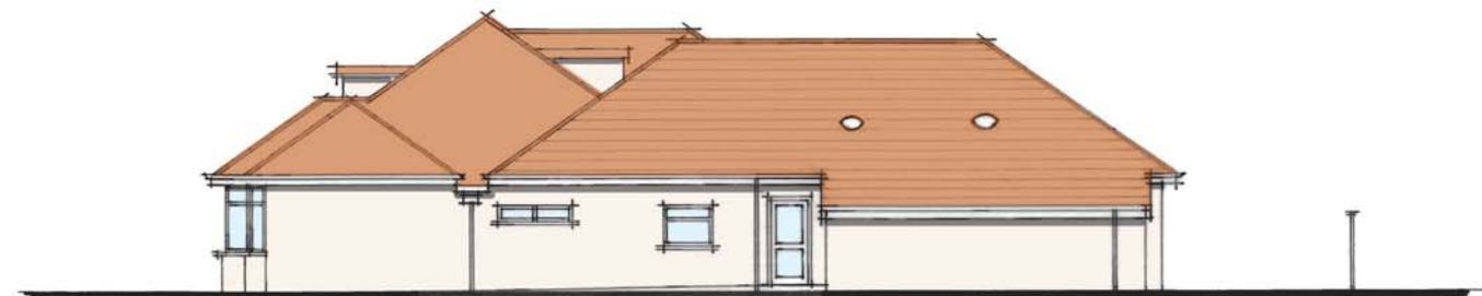
NORTH EAST (SIDE) ELEVATION