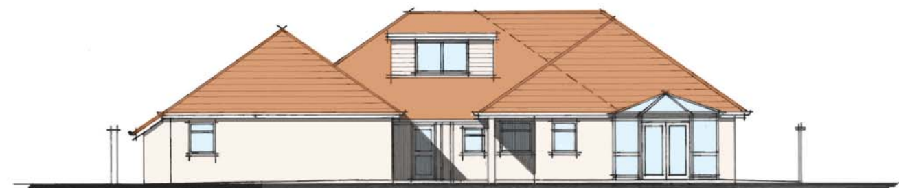
NORTH WEST (REAR) ELEVATION